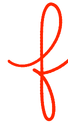
Graph of f

Let f be the function shown above. The function g is defined by \int_0^x f(t) dt