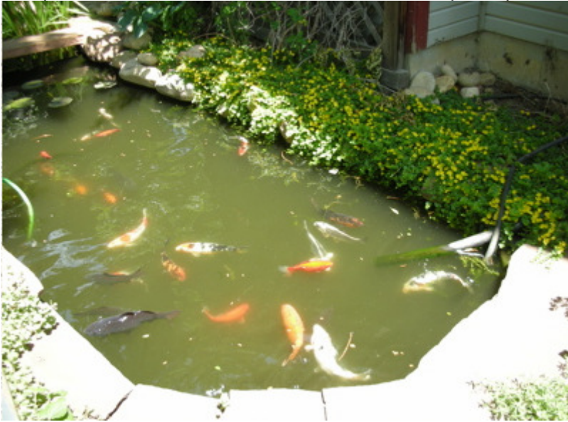
A picture of Ms. McCleary's pond