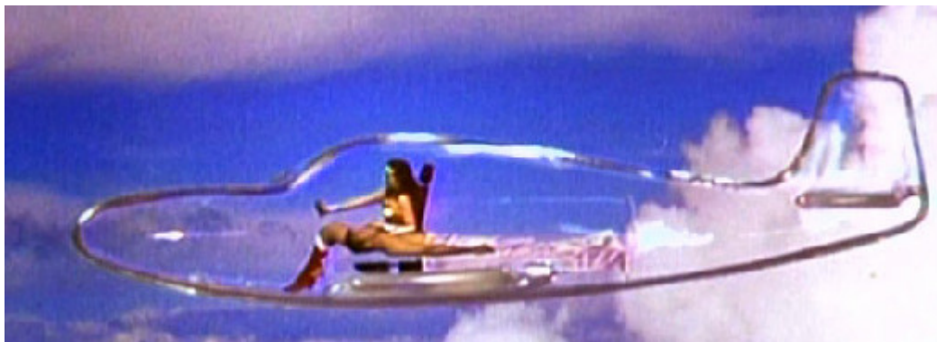
Wonder Woman and her invisible plane!